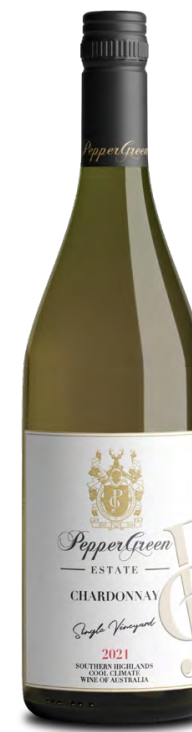
2021 Chardonnay Unoaked Single Vineyard

Pale yellow-straw colour. White peach and a little oak on the nose. Medium body, with attractive white peach flavours and light nuttiness from oak. It finishes with nicely persistent flavours.