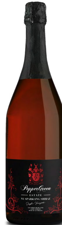
N.V. Sparkling Shiraz Single Vineyard

A blush of misty pink in the glass. Delicate floral, rose petal on the nose. Light and airy, watermelon and red currant notes dance on the palate. Sensational apéritif.