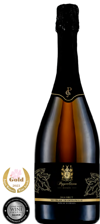
2018 Brut Méthode Traditionelle