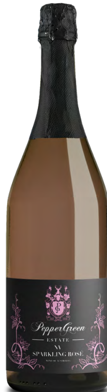
N.V. Sparkling Rosé

Yellow golden colour. The nose shows fresh aromas of stone fruit with a hint of strawberries. Light bodied. The palate is zesty and crisp. This wine finishes clean and refreshing.