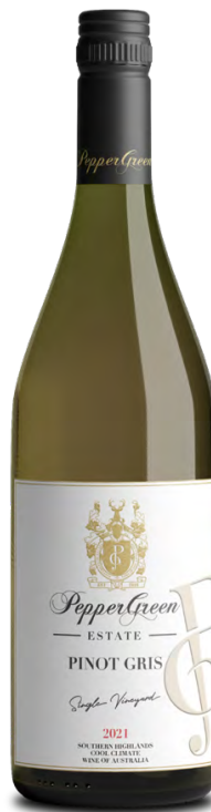
2021 Pinot Gris Single Vineyard

Offering citrus blossom on the nose. A delicate, refreshing palate displaying leanness with a juicy lime backbone. Ultimately refreshing.