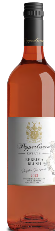
2022 Berrima Blush Single Vineyard

Dark cherry red in the glass. Earthy nose with spicy cedar and bush blackberries, which carry through to the palate. Fresh acidity and a dry finish. Serve chilled.