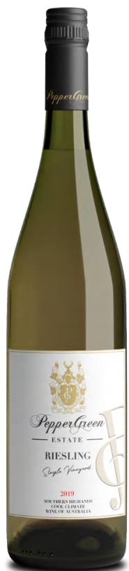
2019 Riesling Single Vineyard